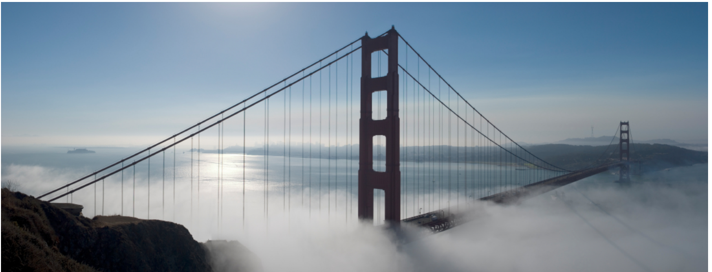
A morning shot showing the bridge partially covered in fog and the sun just outside the top edge. Alcatraz is located near the left edge. A vessel is partially visible in the fog below the bridge. Sutro Tower on Twin Peaks is near the right pylon. The Bay Bridge is faintly visible in the background.

There's much more... See the Santa Clara Convention Center Visitor's Bureau web-site at http://www.santaclara.org/thingstodo for an exhaustive list of places to go and thing to do.